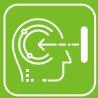
Proactive Facial Recognition