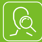
Touchless for Better Hygiene