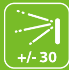
Wide Pose Angle Acceptance