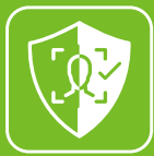
New Height of Anti-Spoofing