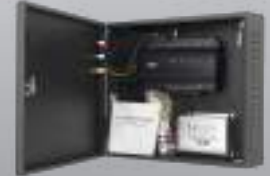
InBio-460 Package B

InBio series is an IP-based biometric access control controller with versatile and flexible functions and it is highly favored in the medium access control management projects with security requirements.