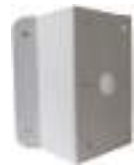
DS-1276ZJ Corner Mounting Bracket