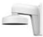
DS-1272ZJ-110-TRS Wall Mounting Bracket