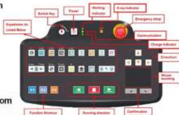
Friendly operation keyboard