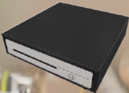
Stainless steel drawer front

Made of heavy gauge steel , suitable for heavy duty use and prolonged operational life, the ideal choice for reliability and perfect platform for any EPoS terminal also the ideal base for large size ECR.